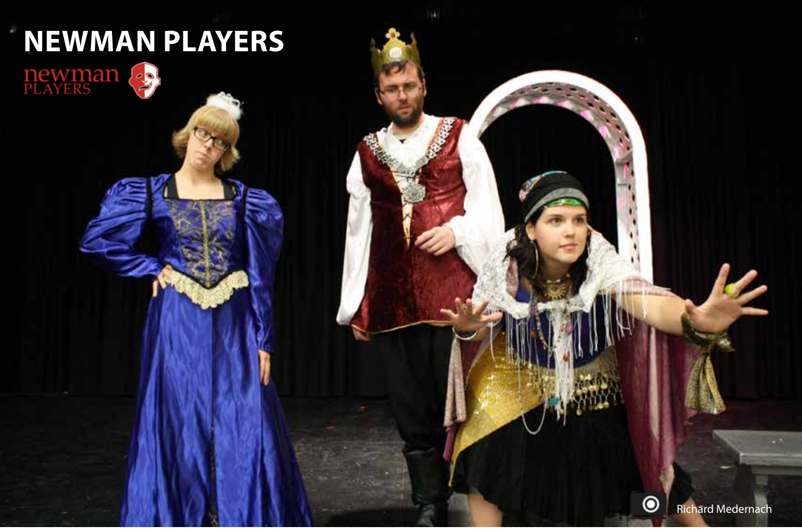
The performing arts tradition at St. Thomas More College remains alive and well thanks to Newman Players and Newman Sounds. We invite students, staff, faculty, alumni, and members of the public to attend our entertaining shows!