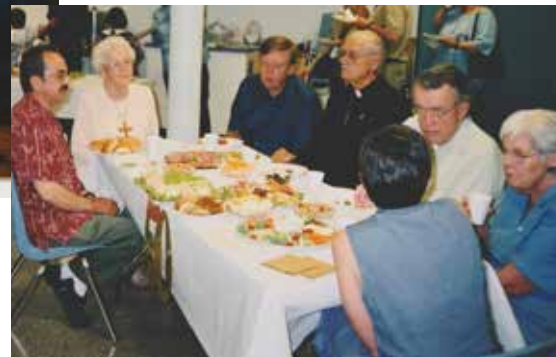
A celebration on the occasion of the 30th Anniversary of the People of the Love of God Prayer Group, St. Paul's Cathedral, Saskatoon.