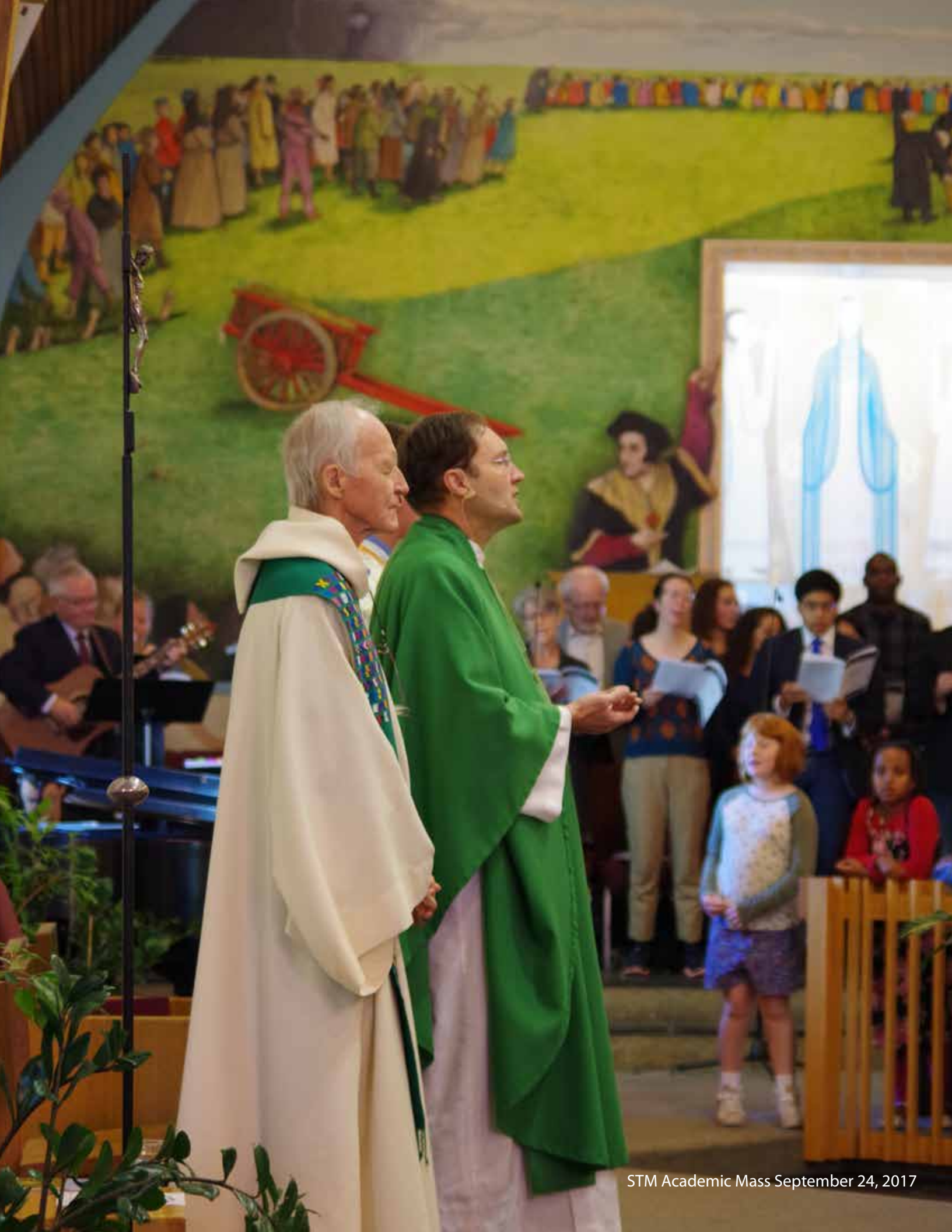
STM Academic Mass September 24, 2017