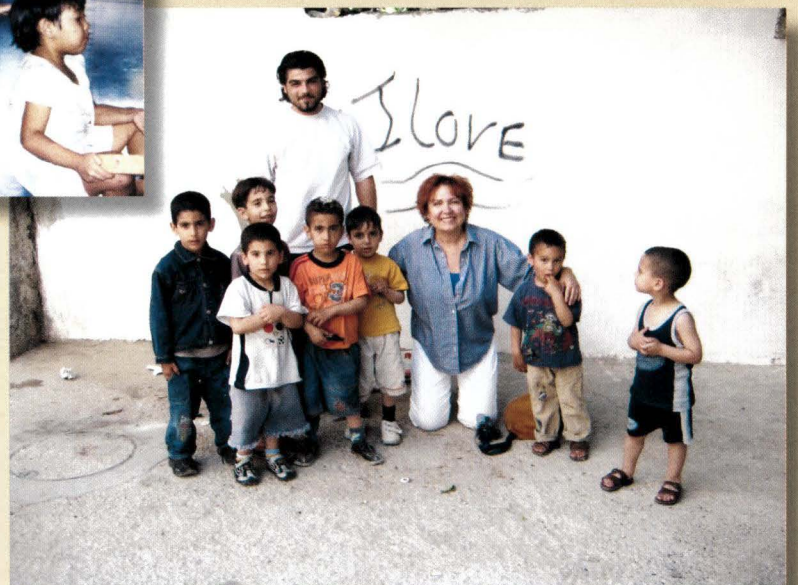
Clockwise from top left: Hutu Village in Rwanda, 2008 Inuit Orphans in Goose Bay, Labrador, 1977 Refugee Camp in Palestine, 2007 Mercy Home in the Bangkok Slums, 2000