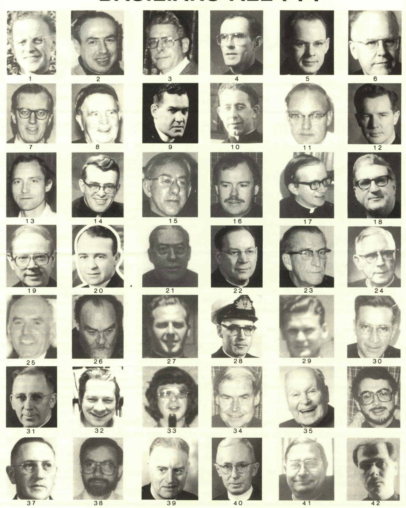
Who helped to write our history—How many do you know? (Answers on page 8) June 1991